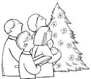
Christmas Eve Service